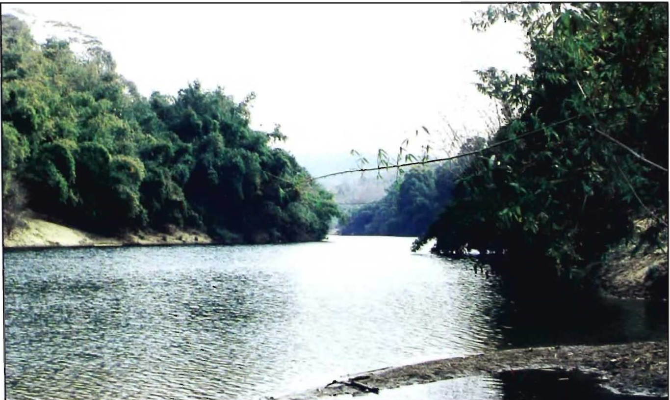
Kopili river at Saibual, Saipung