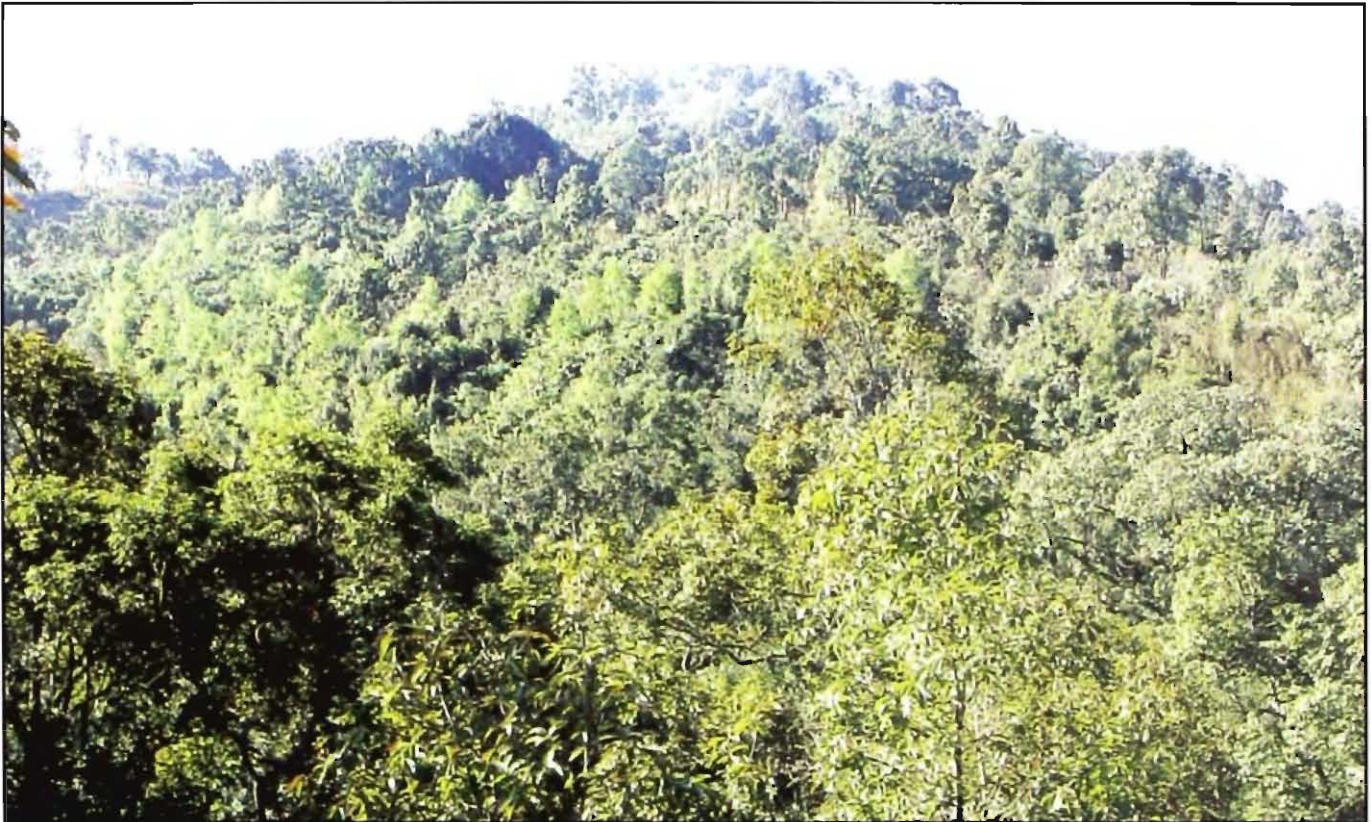
View of forest vegetation in Saipung Forest Reserve