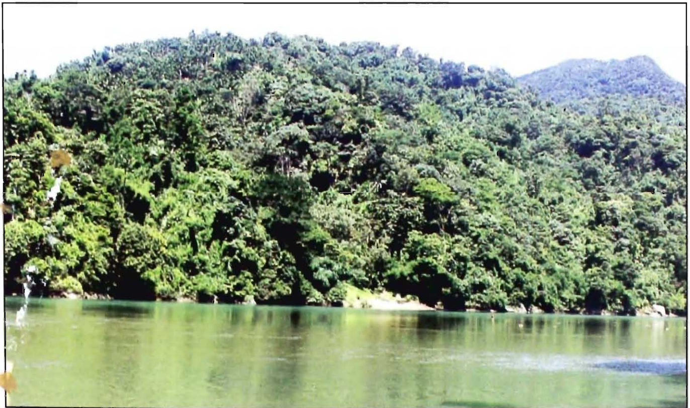
Dense Narpuh forest on bank of river NARPUH-RF-BLOCK-II