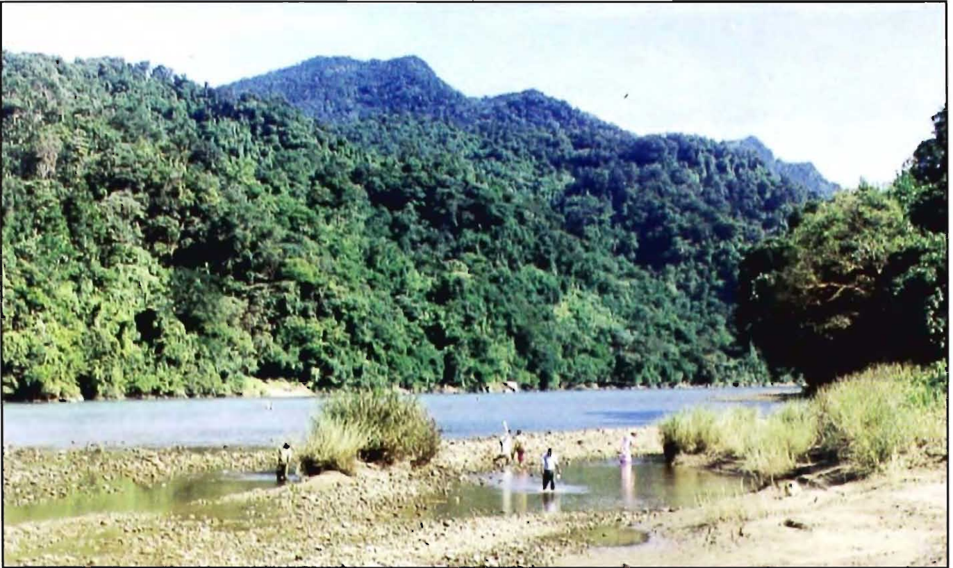
Narpuh Reserve forest Block-I on the Bank of Lubha river