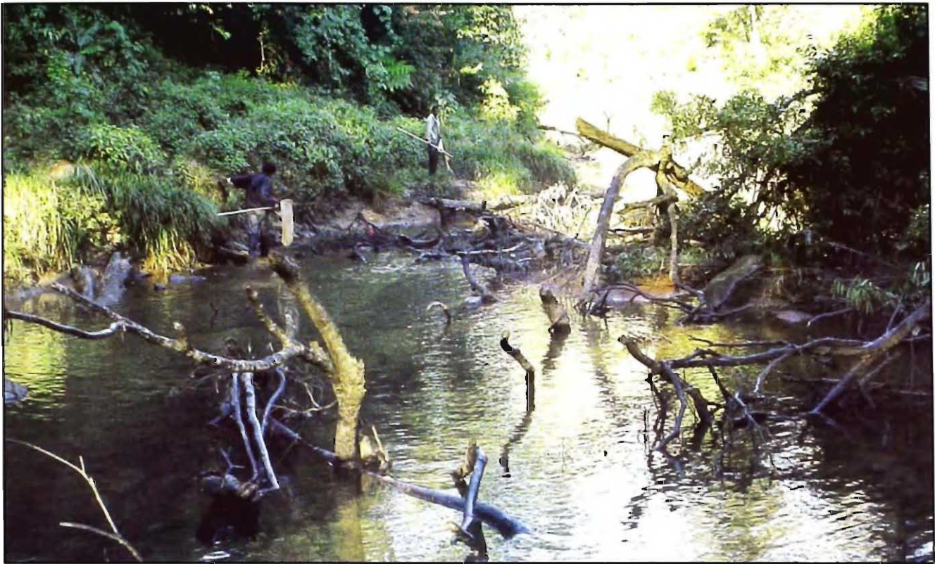
View of river at Saipung