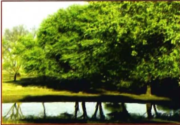
Bhansolao Talao - A man made water body