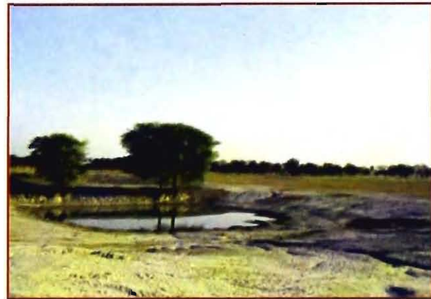
Maharaja Ganga Singh Talao