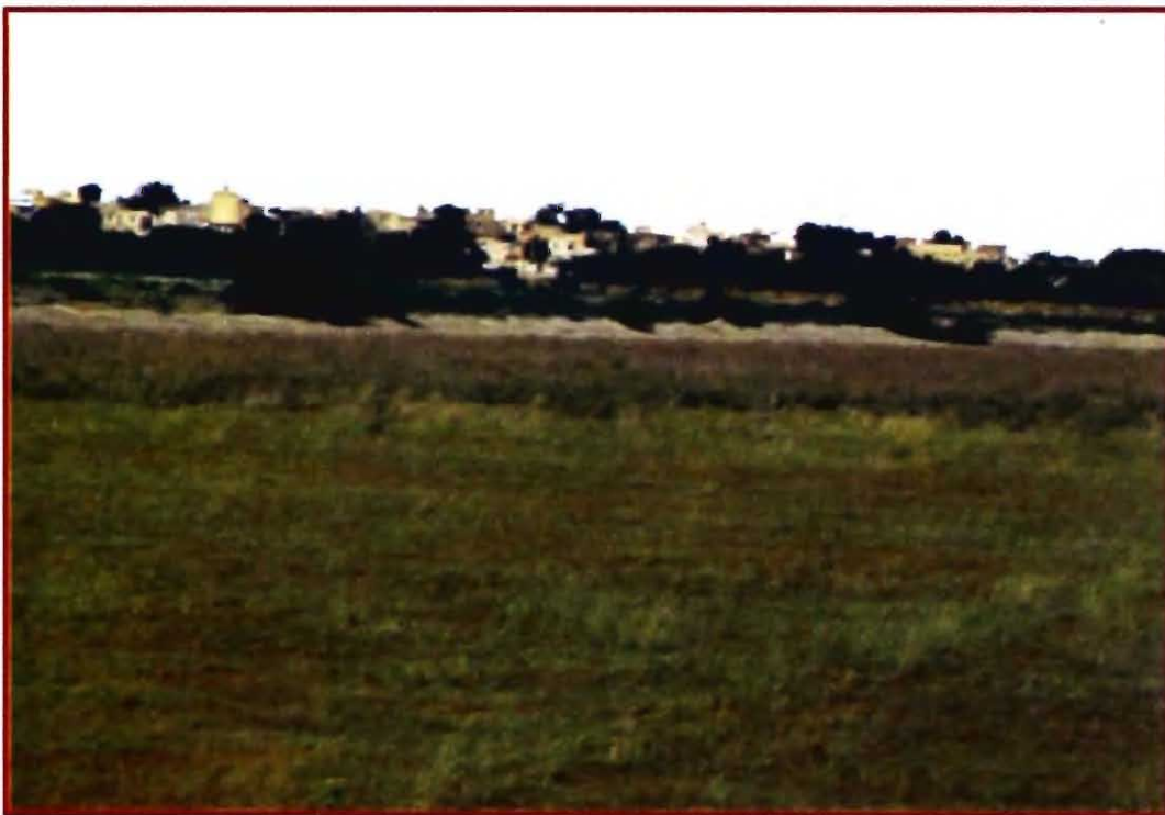
A luxuriant patch of Grassland