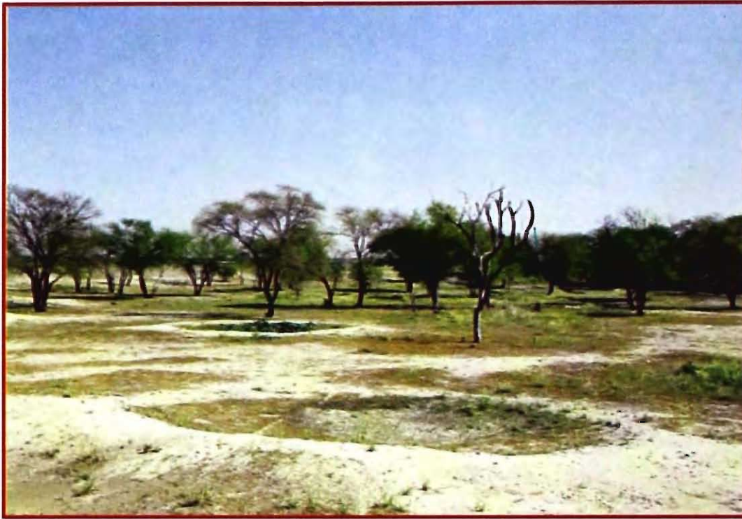
Sparsely Forested Grassland