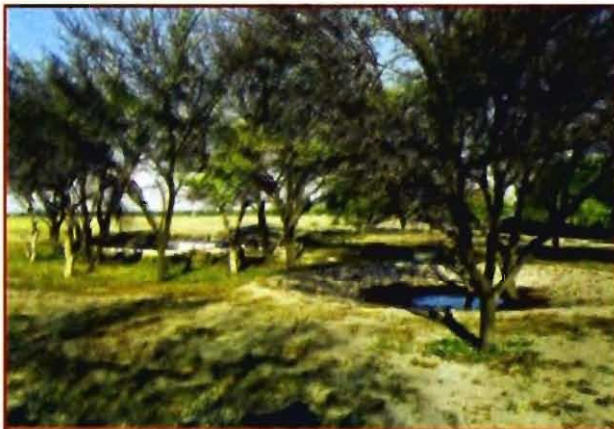
Temporary water holes filled by Forest Deptt.