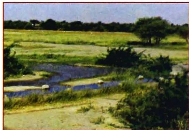
A man made water point