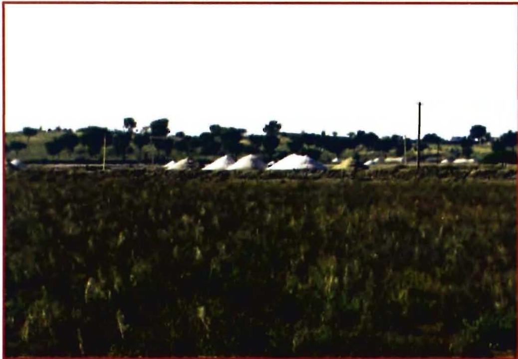
Salt Mining (An-illegal establishment)