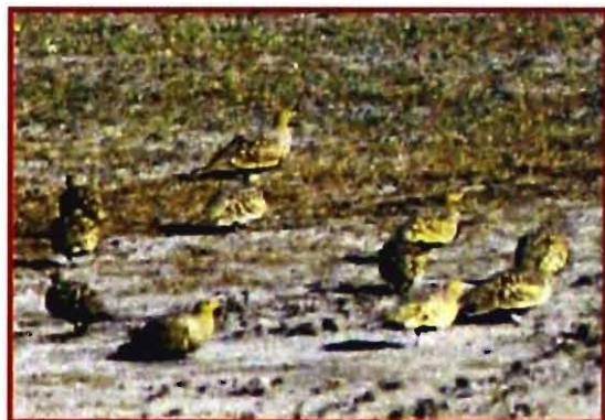
Pterocles orientalis .