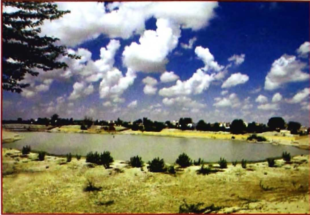
Chadwas Talao - A Village pond in the vicinity