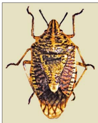
Figs. 4. Agonoscelis nubilis (Fabr.)