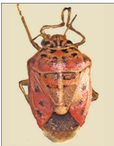
Figs. 2. Antestia cruciata (Fabr.)