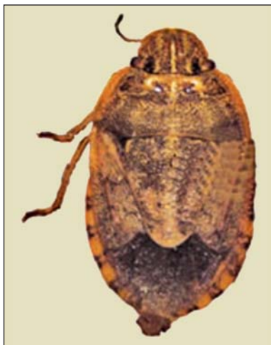
Figs. 23. Sciocoris indicus Dall.