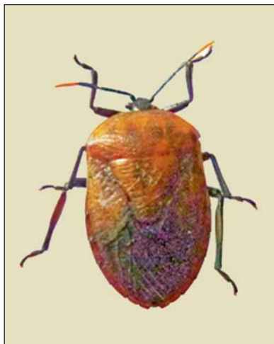
Figs. 32. Coridius brunneus (Thunb.)