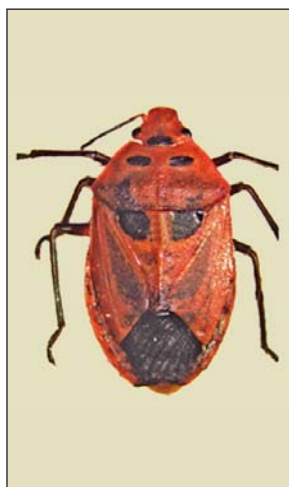
Figs. 26. Amyotea malabaricus (Fabr.)