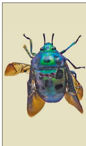
Figs. 36. Chrysocoris stollii (Wolff)