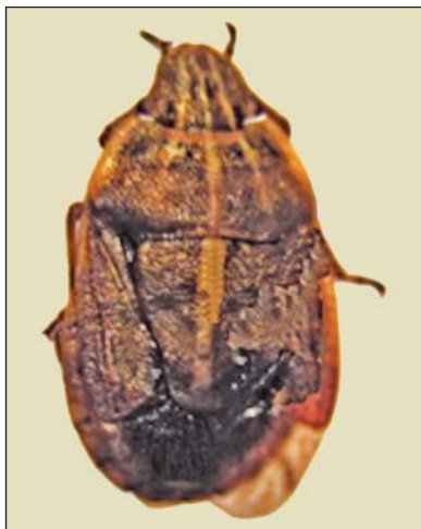
Figs. 22. Menedemus hieroglyphicus Dist.