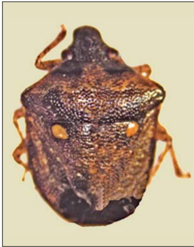
Figs. 11. Eysarcoris montivagus Dist.