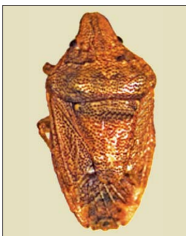
Figs. 5. Gulielmus laterarius Distant