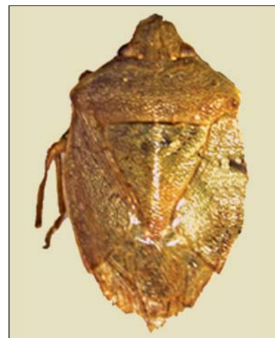
Figs. 18. Acostermum grami Dist.