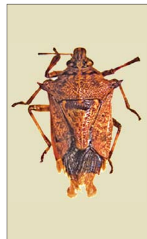
Figs. 28. Eocanthecona furcellata (Wolff)