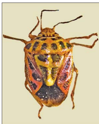
Figs. 1. Antestia anchora (Thunb.)