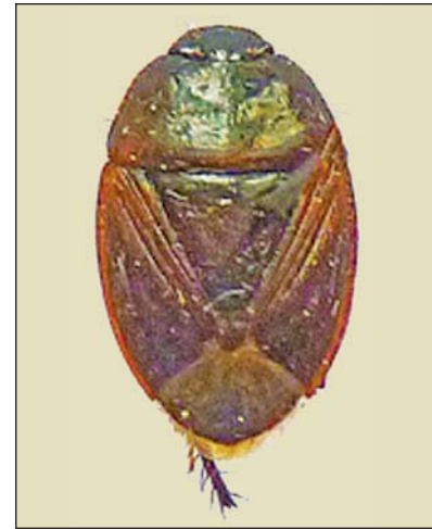
Figs. 31. Macroscyrtus foveolus (Dall.)