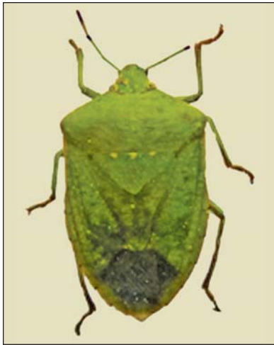
Figs. 19. Nezara viridula (Linn.)