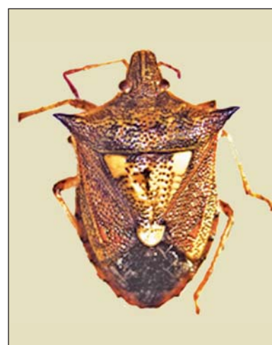
Figs. 9. Carbula scutellata Dist.