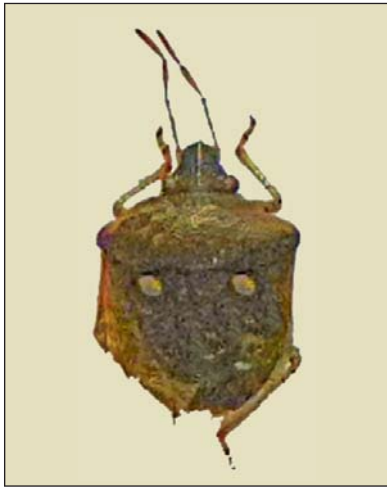
Figs. 10. Eysarcoris guttiger (Thunb.)