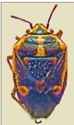
Figs. 25. Bagrada hilaris (Burmeister)