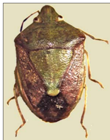
Figs. 3. Plautia crossota Krik