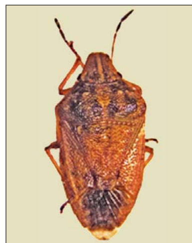
Figs. 6. Adria parvula Dallas