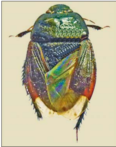
Figs. 29. Adrisa magna (Uhler)