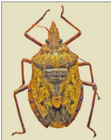
Figs. 13. Halys dentatus Fabr.