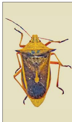
Figs. 27. Andrallus spinidens (Fabr.)