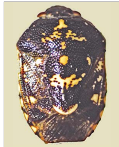
Figs. 15. Apines concinna Dall.