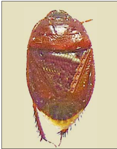
Figs. 30. Macroscyrtus brunneus (Fabr.)