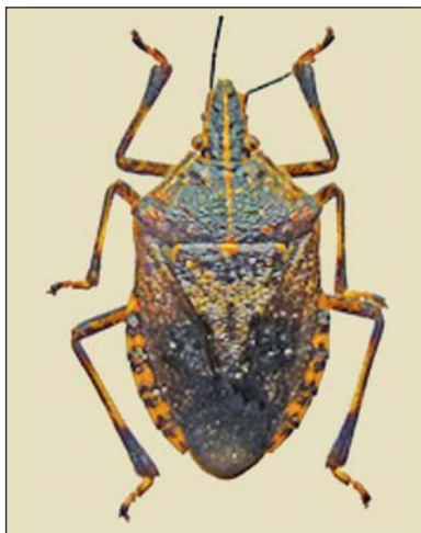
Figs. 14. Erthesina fullo Thunb.