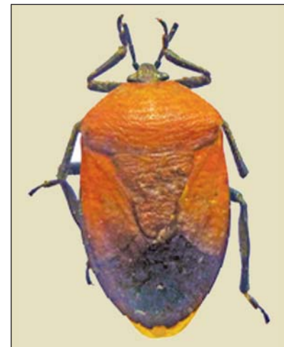
Figs. 34. Coridius obscurus (Fabr.)