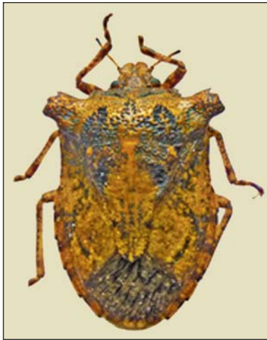
Figs. 20. Placosternum dama (Fabr.)