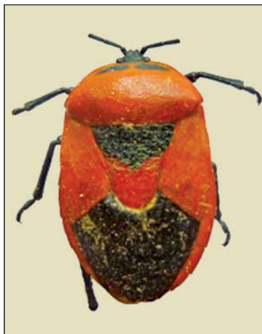
Figs. 33. Coridius ianus (Fabr.)