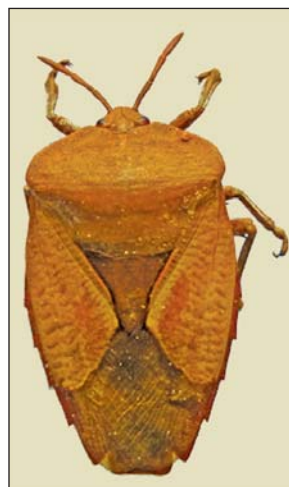
Figs. 37. Tessaratomia javanica (Thunb.)