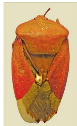
Figs. 38. Tessaratomia papillosa (Drury)