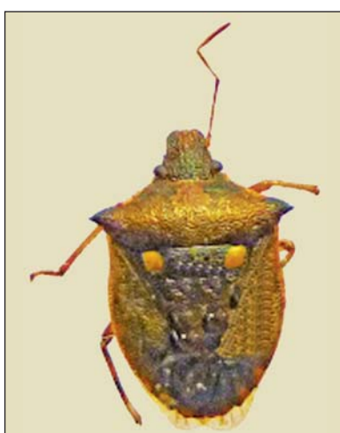
Figs. 8. Carbula aspavia Distant