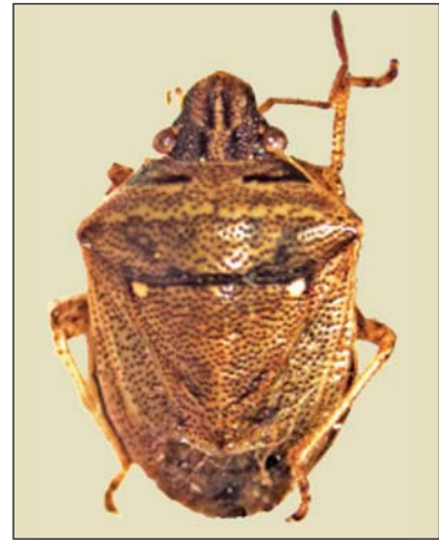
Figs. 12. Eysarcoris ventralis (Walker)