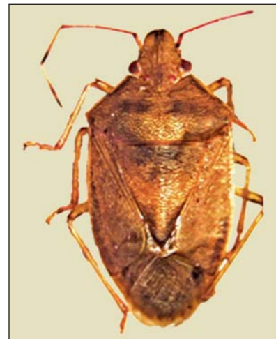
Figs. 24. Niphe subferruginea (Westw.)