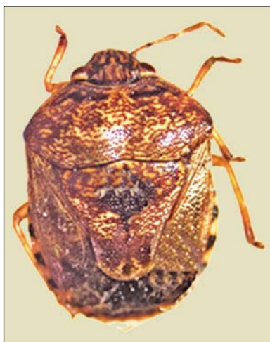
Figs. 17. Menida apicalis (Dall.)