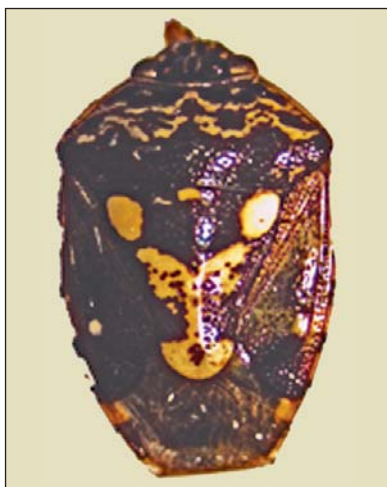
Figs. 16. Menida formosa (Westw.)