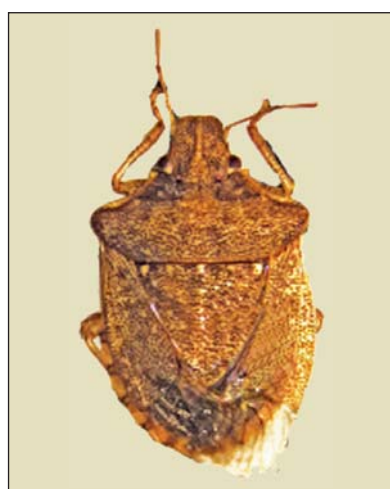
Figs. 7. Carbula insocia Walker