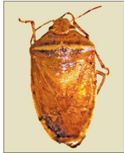
Figs. 21. Piezodorus rubrofasciatus (Fabr.)