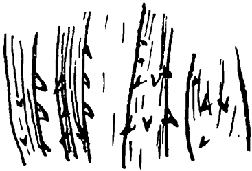
TEXT-FIG. 1.—Gizzard (4 folds shown) of Megalestes major .