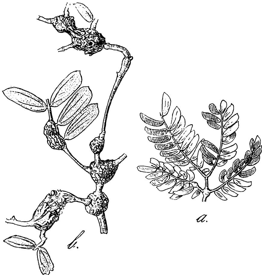
TEXT-FIG. 2.— Lobopteromyia prosopidis , sp. nov. a. A leaf showing some galls ; b. A single pinna with galls magnified showing surface details.

Specimens of this species were bred by the author 1 from galls on the rachides of Prosopis spicigera as early as 1931 in Tanjore, S. India but owing to the unsatisfactory nature of the material the species was not then described. The genus Lobopteromyia Felt itself has not been recorded from India so far.