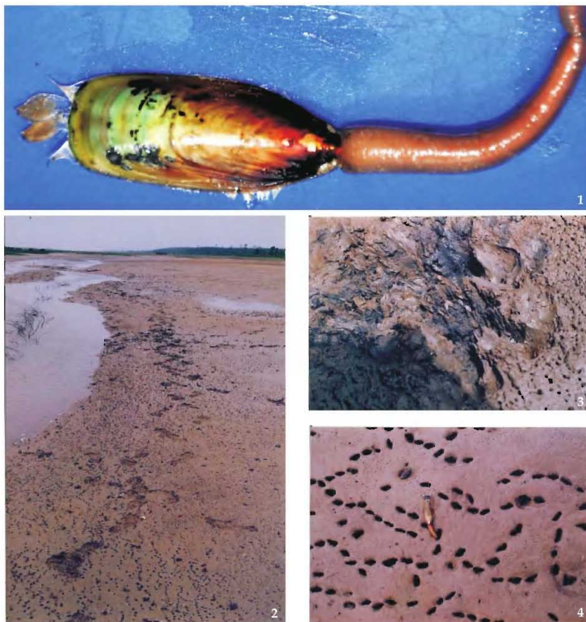
Figs : 1. Lingula anatina (adult). 2. Habitat of Lingula anatina at Subarnarekha estuary. 3. Juvenile bed of L. anatina . 4. Nest hole of lingula anatina with one adult form in its hole