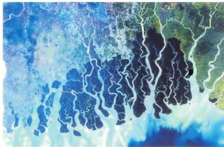
Fig. 2: Satellite picture of Sundarbans