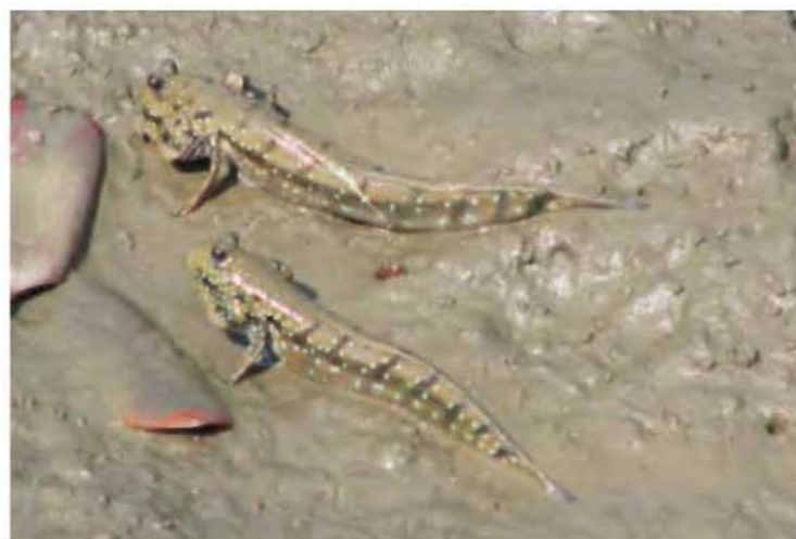
Fig. 3: Most abundant mudskipper, Boleophthalmus boddarti , in Sundarbans