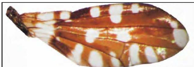
Fig. 4 : Spathulina acroleuca (Schiner, 1868)