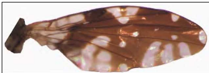
Fig. 2 : Pliomelaena zonogastra (Bezzi, 1913)