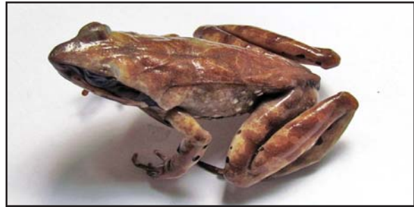
Fig. 6. Megophrys robusta (Boulenger, 1908)