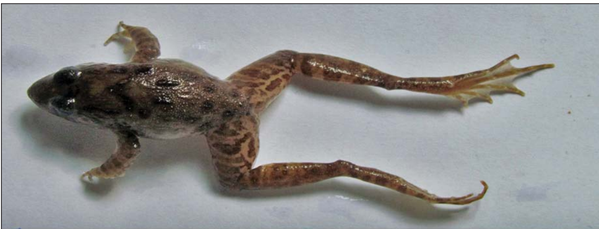
Fig. 4. Zakerana syhadrensis (Annandale, 1919)