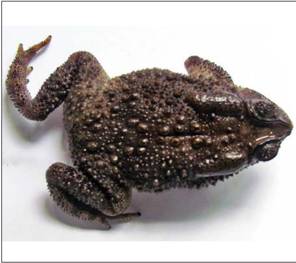
Fig. 1. Duttaphrynus melanostictus (Schneider, 1799)