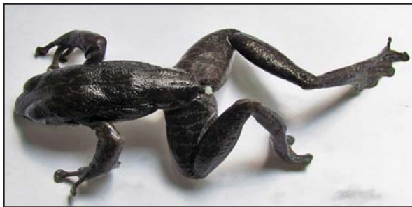
Fig. 7. Amolops assamensis Sengupta et al., 2008