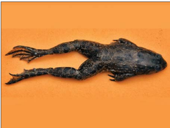
Fig. 3(A). Euphlyctis hexadactylus (Lesson, 1834)