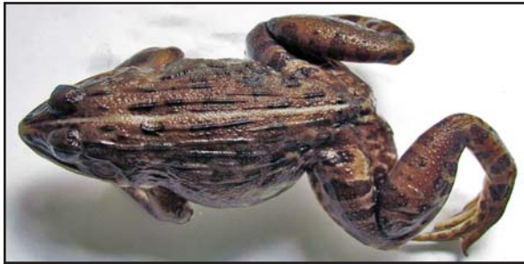
Fig. 5. Hoplobatrachus tigerinus (Daudin, 1802)