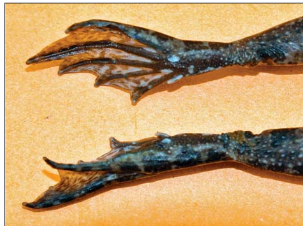
Fig. 3(B). Euphlyctis hexadactylus (Lesson, 1834), showing the large inner metatarsal tubercle.