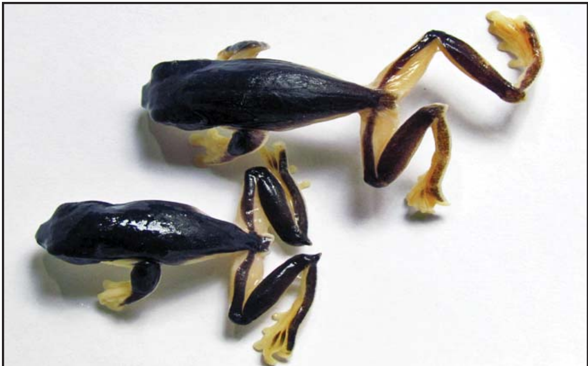
Fig. 9. Rhacophorus bipunctatus Ahl, 1927