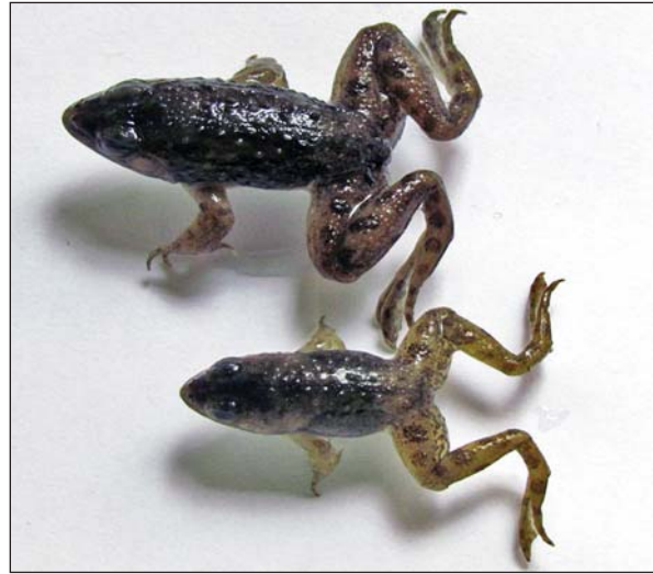
Fig. 2. Euphlyctis cyanophlyctis (Schneider, 1799)